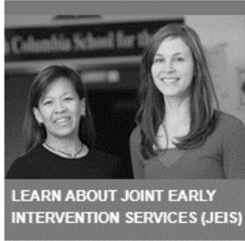
LEARN ABOUT JOINT EARLY INTERVENTION SERVICES (JEIS)