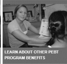
LEARN ABOUT OTHER PEPT PROGRAM BENEFITS