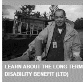
LEARN ABOUT THE LONG TERM DISABILITY BENEFIT (LTD)