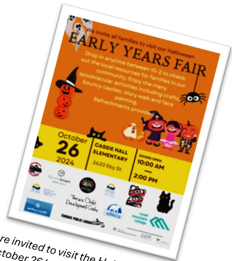
All families are invited to visit the Halloween Early Year Fair to be held on October 26 between 10am and 2pm at Cassie Hall Elementary School. Welcome!