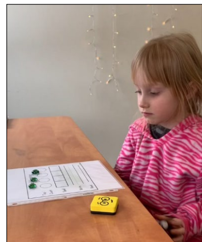
A CMSD82 student participates in a literacy assessment.