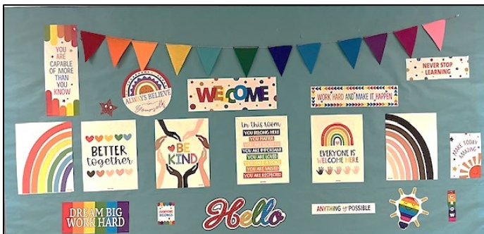
Bulletin board photo courtesy of Nechako Elementary School.

Individual Education Plan meetings are happening during the month of October with school teams. An IEP is a written educational plan for special education students designed to describe programming modifications and/or adaptations and to indicate specific services provided. The IEP is a "living" process that has the potential to guide assessment, planning, collaborative communication and teaching. An IEP need not be a lengthy document but must include evidence of planning for student needs, demonstrate a plan to utilize varied instructional strategies