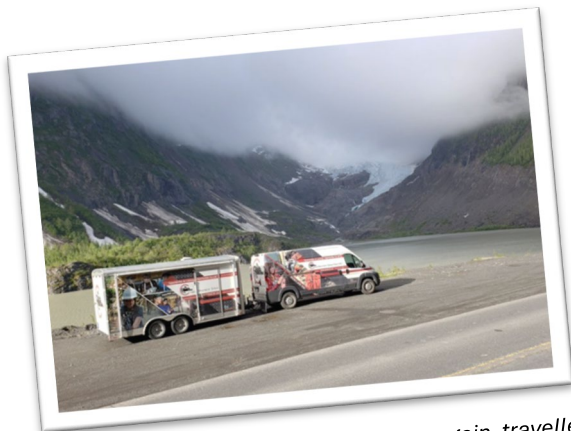
CMSD82 Trades Van was on the move again, travelled to Stewart. Thank you to LNG Canada for their generous support of the Discover Trades Program.