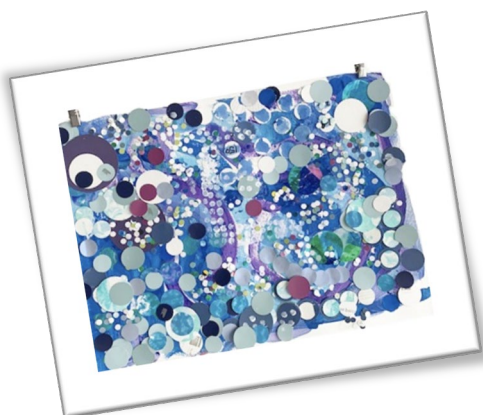
Misty Rivers Art Gallery in Hazelton recently displayed the artwork of learners from New Hazelton Elementary School.