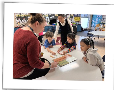
Learners at Majagaleehi Gali Aks Elementary School in Hazelton engage in focused literacy instruction as part of a pilot project supported by the Indigenous Education Department.