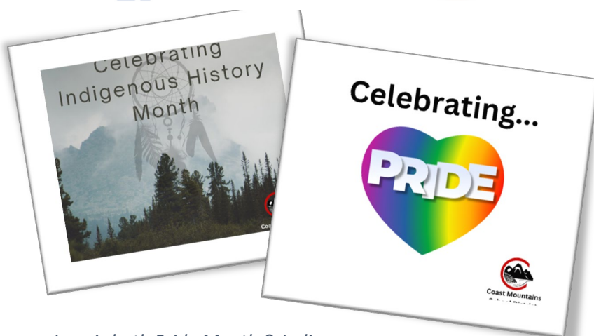
June is both Pride Month & Indigenous History Month in Coast Mountains School District.