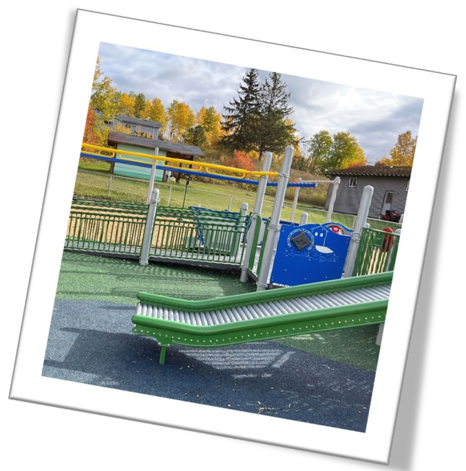
The Majagaleehl Gali Aks Elementary School community recently opened their new accessible playground structure.

Coast Mountains School District acknowledges with respect the lands on which we live, work, play and learn as the traditional & unceded territories of the Gitxsan, Haisla, Nisga'a & Ts'msyen Peoples.