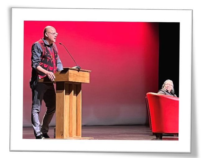
On September 22 CMSD hosted a conference style day of learning for all employees focused on ReconciliACTION.