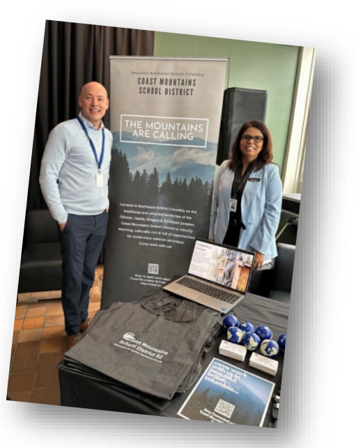
Coast Mountains School District participated in a recent teacher recruitment fair.