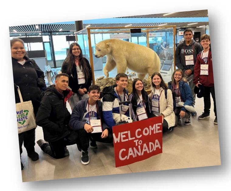
As part of the growing International Student Program, learners from Brazil and Chile arrive at the Northwest Regional Airport in Terrace for second semester studies.