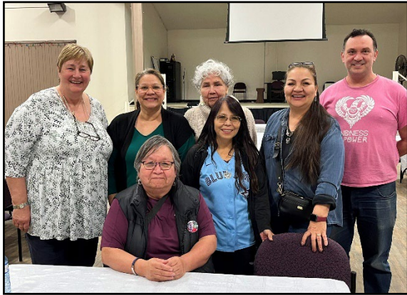
Members of the Gitxsan Language Curriculum Development Team following a session at Hagwilget Hall.

Four community information sessions were held across the traditional Gitxsan laxlip (territory) during the month of April to share details of the proposed Gitxsan Immersion program launching as early as September 2024. Discussions were