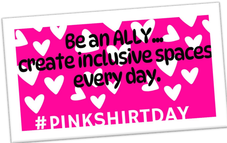
February 28 was Pink Shirt Day where allyship was promoted across schools, creating spaces where all feel safe, valued and heard.