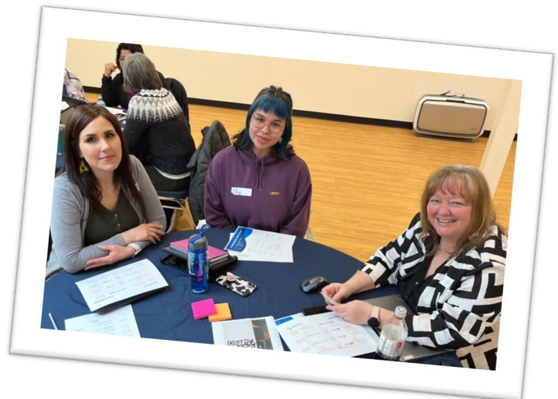
The All Our Relations Working Group gathered to dialogue around improving outcomes for Indigenous children and youth in Coast Mountains School District.