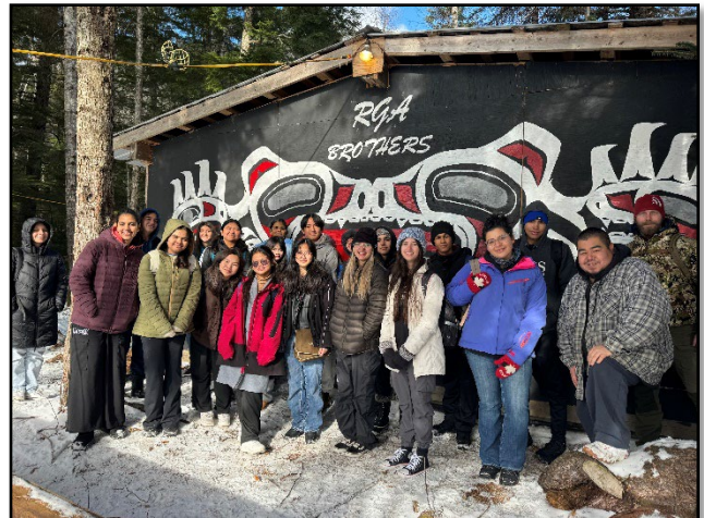
CMSD International Students experienced the oolichan harvest recently on an excursion to Kincolith in the Nass River Valley.