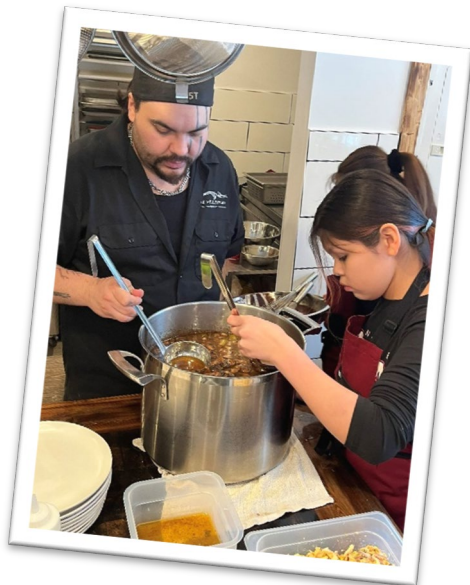
Secondary learners from Parkside and Caledonia Schools participated in a Youth Trades Sampler hosted by our partners at Kitselas Five Tier Systems (K5T).