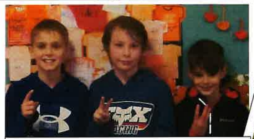
First Second Third First 3 runners to make it 'home'.