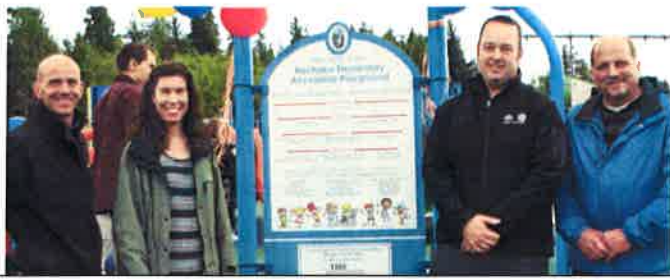
Kitimat's First All-Inclusive Play Space. More photos and Descriptions in the October Newsletter.